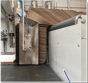
Moveable upper-deck with back tamper for high capacity