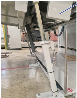
Lifting units For smooth lifting of extendo with safety legs.