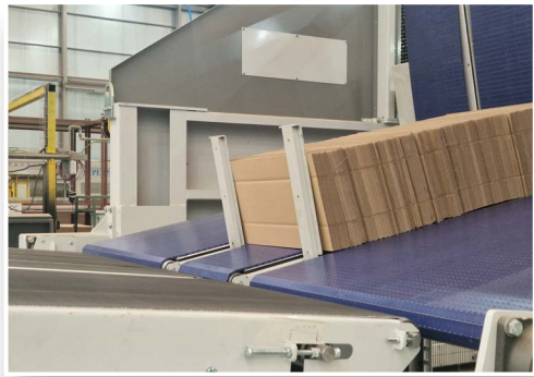
Top of stack fingers for controlled board movement