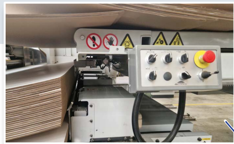
Back tamper And extendo control box.