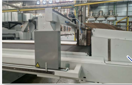
Pre-hopper tamper with moveable gate for good alining of the board