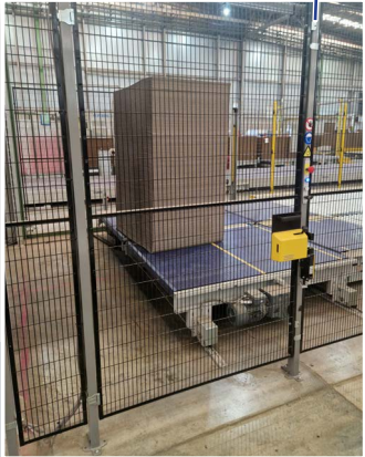
Easy access Via door in fencing.