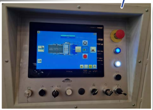
Main control panel With integrated user-friendly touch screen.